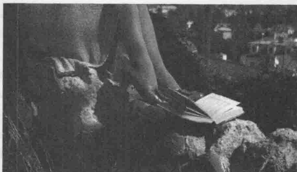
Fig. 2 Screenshot from Shoes . Courtesy of Costa Fam

comes to pay his tribute to the deceased at the Auschwitz museum. Ironically, he is the only character who is shown in full.